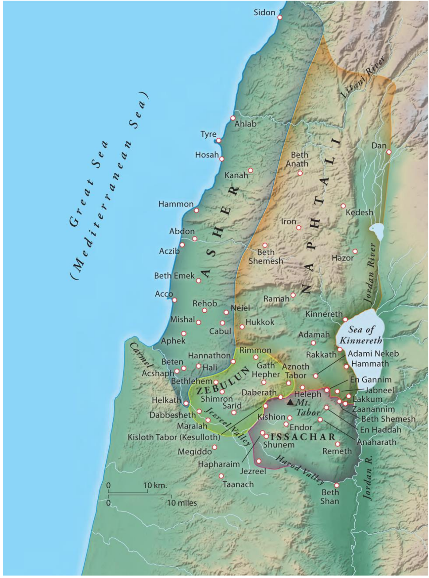
© Zondervan Atlas of the Bible, 2010